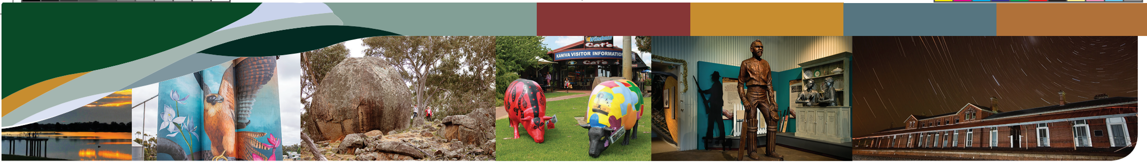
L-R: Lake Wallace, Edenhope; Silo Art, Kaniva; Baileys Rocks; Sheep Art, Kaniva; Harrow Discovery Centre; Serviceton Historic Railway