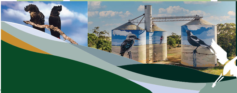
L-R: Red-tailed Black Cockatoos; Silo Art, Goroke

Contact us for more information westwimmera.vic.gov.au