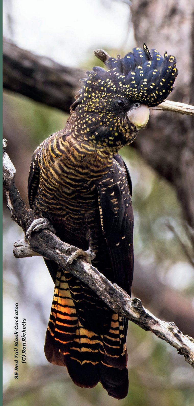
SE Red Tail Black Cockatoo

Parking available, but on natural landscape